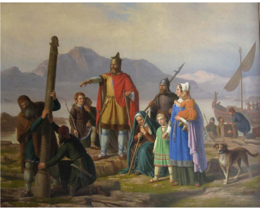
Ingolf by Raadsig