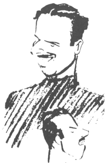
MOSLEY BY LOW

As early as 3 rd May 1925 when introducing his economic proposals to five thousand people who queued to hear him speak at Birmingham Town Hall, Mosley attacked the 'strange view that Socialists could do nothing until Capitalism had collapsed'. His Birmingham Proposals 18 provided the ideal transition to Socialism because they gave the State power over the Capitalist economy.